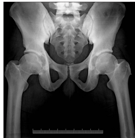
Figure 4: Dense pelvic bones and femorii

Most of the reported patients of sclerosteosis are from the Afrikanar population [5] (descendants of the Dutch settlers) of South Africa. To our knowledge, this is the first such report from India.