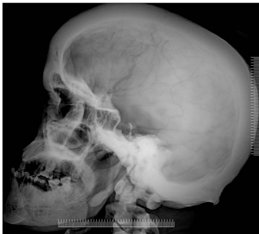
Figure 3: Sclerosed skull bones