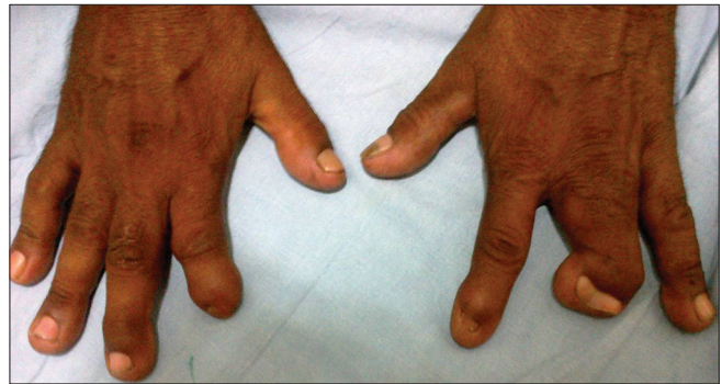
Figure 2: Syndactyly and hypoplastic nails