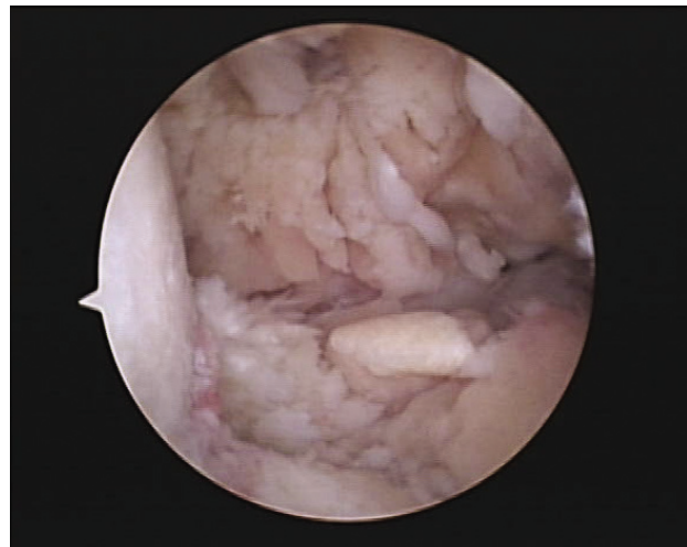
Figure 2. Arthroscopic view of the elbow joint. Severe inflammatory changes in hypertrophic synovium is observed.

prednisolone, methotrexate and cyclosporine A. Despite treatment, the symptoms remained active. Three months prior to admission she was started on etanercept injections (25 mg, twice weekly) combined with methotrexate, prednisolone and aceclofenac. A purified protein derivative (PPD) skin test performed before administration of etanercept was negative with 3 mm induration and a chest X-ray revealed no evidence of tuberculosis. The patient did not have a history of tuberculosis nor any known exposure to persons with active tuberculosis. The articular symptoms improved gradually after the etanercept injections. The serial laboratory tests showed improvement during the use of etanercept (Table 1). However, one month before admission, the patient began to experience swelling and pain of the right elbow joint. Intermittent fever and anorexia were also reported to be present. Her temperature was 38°C, blood pressure 130/80 mmHg, and pulse 80/