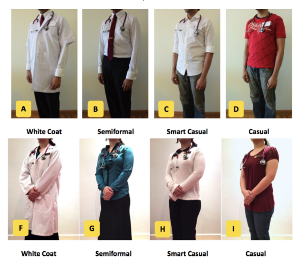
Figure 1. Pictures of male and female doctors in four different ensembles

For the final part of the questionnaire, patients who chose the doctors with white coats for any of the initial two questions were asked whether their preference would change if the white coats were potential sources of