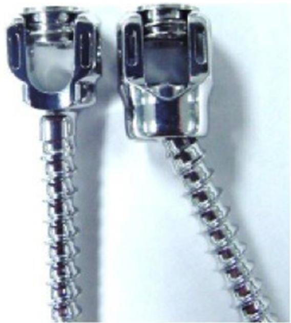
Figure 3 An example of the Shilla screw with cap.

Note: This configuration allows for the rod to slide freely.