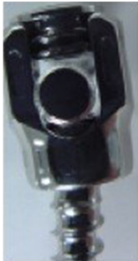
Figure 1 The Shilla screw with cap and rod in final position.

Fixed or monoaxial pedicle screw fixation (Figure 3) is only used at the apex of the curvature to maximize derotational correction. The placement of these screws involves a subperiosteal dissection and disruption of the potential growth at these levels. Both sides of the apex are instrumented to allow for firm control and maximum correction of the