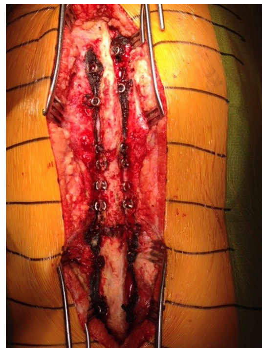
Figure 5 In situ metallosis in patients.

Note: In situ metallosis has been seen in many patients and has not shown any adverse effects on the individuals.