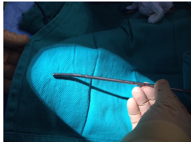
Figure 4 This image shows in situ wear on the rod from the Shilla screw.

A recent retrospective review of 33 patients with a 5-year minimum follow-up on patients treated with SHILLA instrumentation for early-onset scoliosis (neuromuscular, idiopathic, congenital, syndromic) showed promising results. The average follow-up on these patients was 7 years