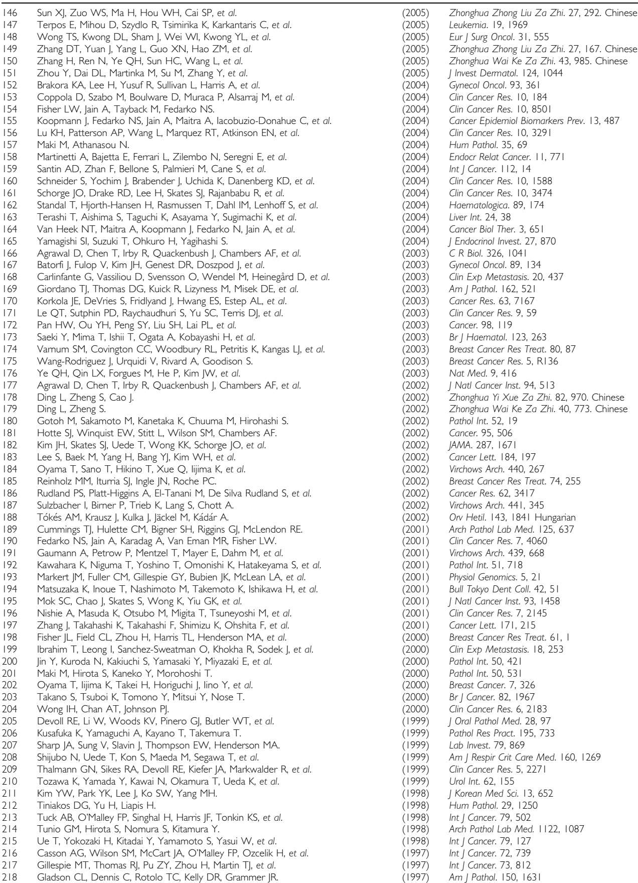
Table I (Continued)