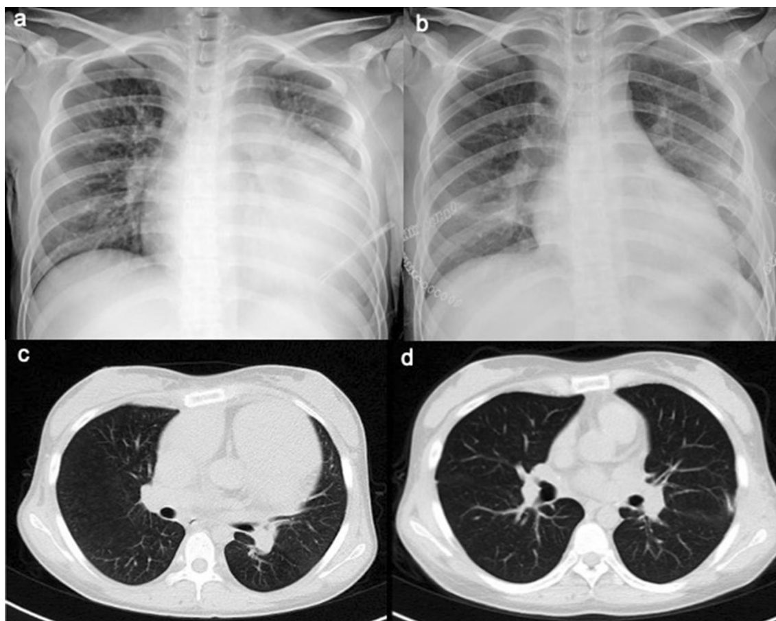
Figure 2. Radiological examination. a, b: A chest radiograph of a child patient with IPAH was taken at 19 days before surgery (a). The chest radiographs of the IPAH child were performed one month after surgery (b). The CT examination of the IPAH child was implemented 5 months before surgery (c). The CT examination of the IPAH child was carried out 2 months after surgery (d). Comparisons of preoperative and postoperative images revealed significant improvement in IPAH after surgery.

The average operative time in IPAH cases, of 466 \pm 55 min, was significantly longer than that in non-IPAH group, of 364 \pm 53 min ( P = 0.019 ). Days of post-operative mechanical ventilation period differed in the two groups with 20 \pm 9 days in IPAH group and 2 \pm 1 days in non-IPAH group ( P = 0.006 ). There were no differences in blood loss volume, blood transfusion volume, ICU stay and total hospital stay between the two groups. ECMO was intraoperatively used in all IPAH patients and one BO patient with statistically significant ( P = 0.033 ). There was no significant difference in postoperative complications and survival between the two groups (Table 5).