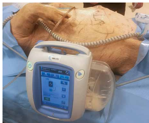
Photo 6. Seal check of NPWT

In the last decades, up to 15% of trauma laparotomies have been managed using OA [3]. Well-known problems with prolonged OA are development of lateralization of the abdominal wall, adhesions and frozen abdomen [1]. Moreover, fascial closure rates