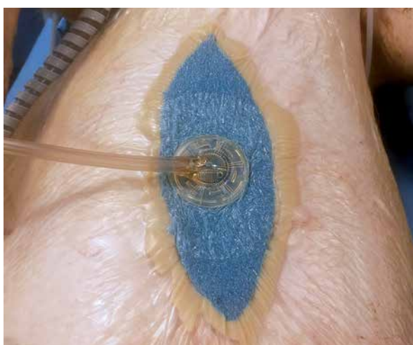
Photo 5. Polyurethane foams applied over the protective layer and stabilized with stomapaste. Application of adhesive drape and track-pad. NPWT sealed and set in continuous mode

the abdominal cavity (Photo 4). The wound protector and laparoscopic ports were removed. A rectangular-shaped piece of polyurethane (PU) foam was applied over the non-adhesive protective layer to distribute negative pressure within the abdominal cavity. Additionally, another piece of PU foam was applied over the previous piece of PU foam stabilized with stomapaste (Stomahesive, Convatec, Poland) to keep the system sealed and to facilitate track-pad application. Then, an adhesive drape was applied