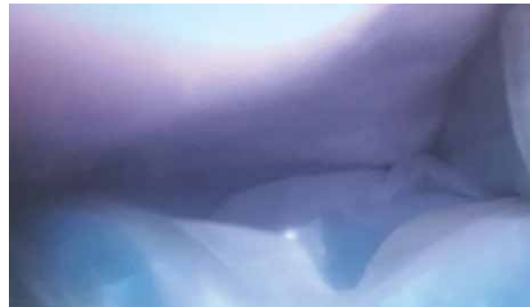
Photo 4. Intraoperative view. Non-adhesive protective layer placed precisely over the exposed abdominal organs

and -80 mm Hg was set in continuous mode (Photos 5 and 6). Skin incisions at port application sites were sutured with 3-0 non-absorbable sutures (Ethicon US, LLC).