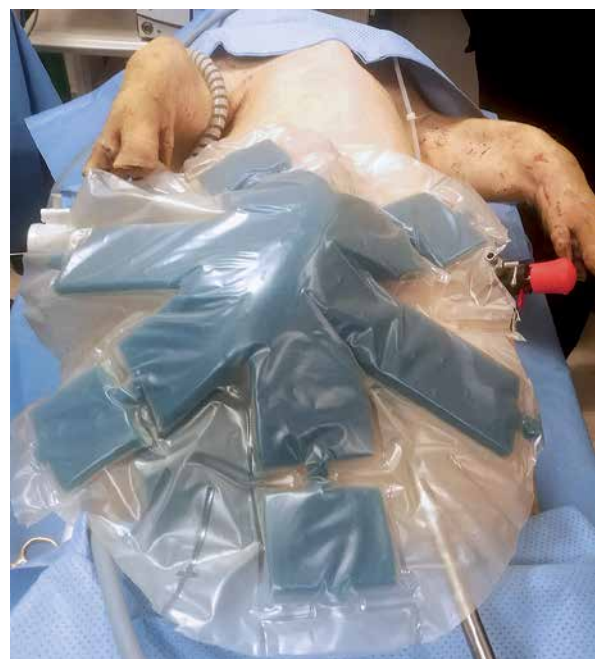
Photo 2. Preparation of non-adhesive protective layer. A protective layer trimmed to appropriate size with excised part of protruded polyurethane foam