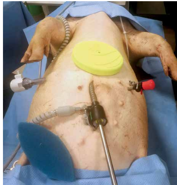
Photo 1. Swine positioning, surgical incision and locations of laparoscopic ports

sive protective layer was spread over the exposed organs within the abdominal cavity. Attention was paid to distribute it precisely in every quadrant of