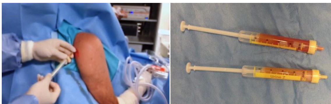
Fig. 2 – Left image shows a puncture in the glenohumeral joint. Right image shows the aspirated purulent liquid.