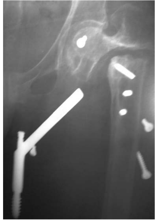
Fig. 3. Anteroposterior plain radiograph of the patient revealed nonunion and incredible position of broken device in medial of thigh.