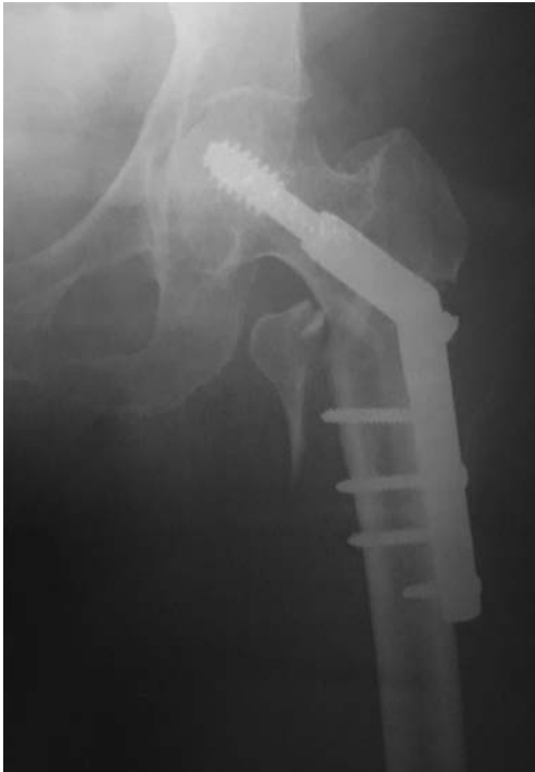
Fig. 2. Post-op anteroposterior plain radiograph displayed reduction and fixation with DHS implant.

of left side. The mechanical stability of DHS to achieve union in this case was inadequate; therefore implant failure was clear from beginning. Another cause of failure in this case would be occult infection which was ruled out by exam and normal laboratory data.