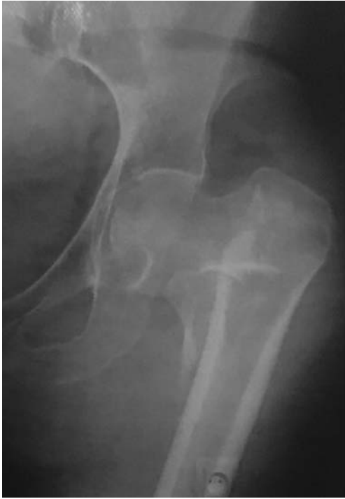
Fig. 1. Pre-op anteroposterior plain radiograph showed unstable pertrochanteric fracture.