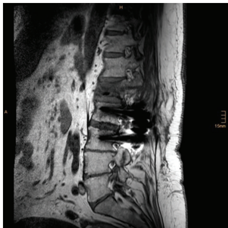
FIGURE 4: Postoperative sagittal MRI (T1-weighted) at the level of the pedicles (left).