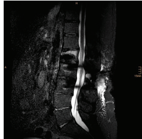
FIGURE 2: Postoperative sagittal MRI (STIR).

Bipedicular balloon kyphoplasty was performed using polymethylmethacrylate bone cement. On both sides, the balloons were inflated under visual and pressure control. 2 mL of cement per side, 4 mL in total, was inserted under fluoroscopic monitoring in the vertebra. Intraoperative fluoroscopy showed no evidence of cement leakage, indicating that the intervention had been well performed.