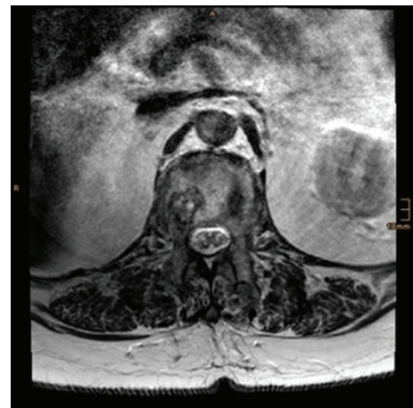
FIGURE 3: Postoperative axial MRI (T2-weighted) at the level of L1.