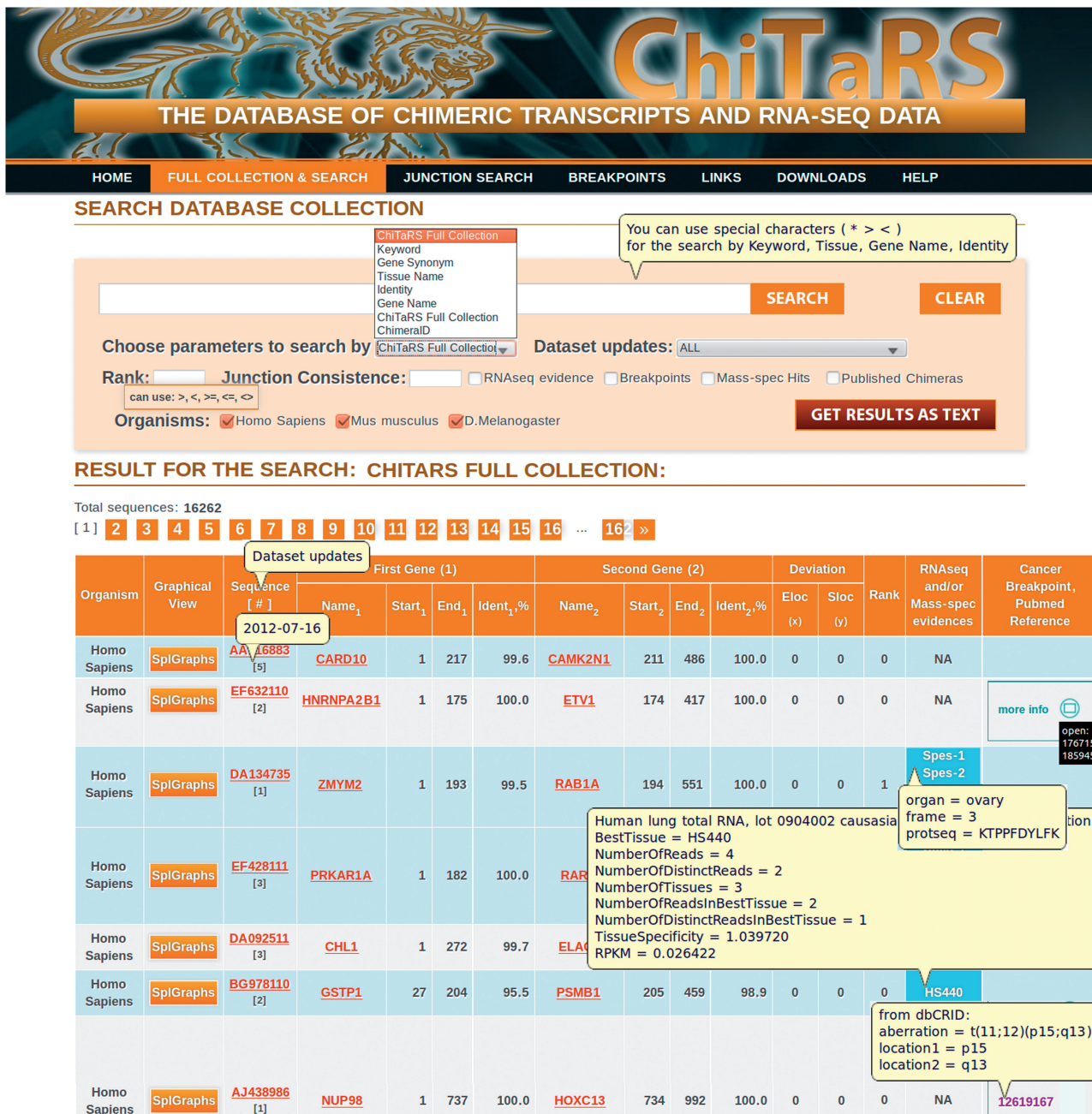
Figure 2. The ChiTaRS full collection page. The full collection ('Full Collection & Search') consists of 16262 transcripts in human ( H. Sapiens ), mouse ( M. Musculus ) and fruit fly ( D. Melanogaster ). The search can be performed using ESTid ('ChimeraID'), the names of the genes participating in the chimeras ('Gene Name', e.g. LMNA, DDX5), a sequence identity score ('Identity', e.g. 100, 95), a tissue type ('Tissue Name', e.g. lung), gene synonyms ('Gene Synonym') or a keyword ('Keyword', e.g. RARA). The RNA-sequencing results and the breakpoints can be extracted by clicking on the corresponding check-boxes and then 'Search'.

found 'chimeric' RNA-seq reads to this junction site. This special feature of ChiTaRS allows users to identify to what extent their chimeric transcripts are similar to those for which there is RNA-seq data in the database. It is essential for scientists to be able to analyze their chimeras in the complex setting of a large high-throughput data set and with multiple sequences. In the 'Downloads' section, we provide all the unmapped reads for the