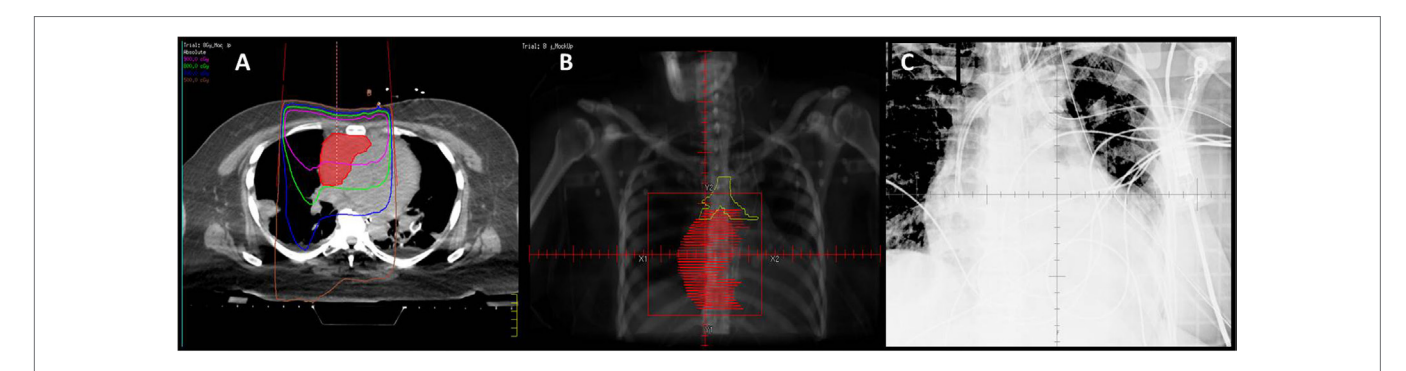
FIGURE 2 | (A) Mock-up of clinical setup 8 Gy x 1 Gy, based on depth and field size calculations from prior CT simulation in supine position. (B) Mock-up of DRR for clinical setup with GTV (red). (C) kV image of AP setup.