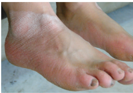
FIGURE 3: Involvement of external malleolus in case 5.