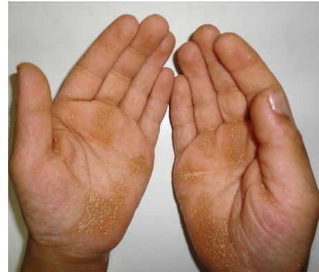
FIGURE 1: Palmar hyperkeratosis in case 5.

In this series, six cases (two females and four males) with PLS were recruited. The mean age was 15.6 \pm 10.4 years. In fifty percent of the cases, consanguinity was confirmed in parents (first degree cousins). Pregnancy and delivery were normal in all cases. All of the cases were found within the same family (first- or second- degree relatives), and all came from low socioeconomic backgrounds. Patients' demographic and clinical data have been summarized in Table 1.