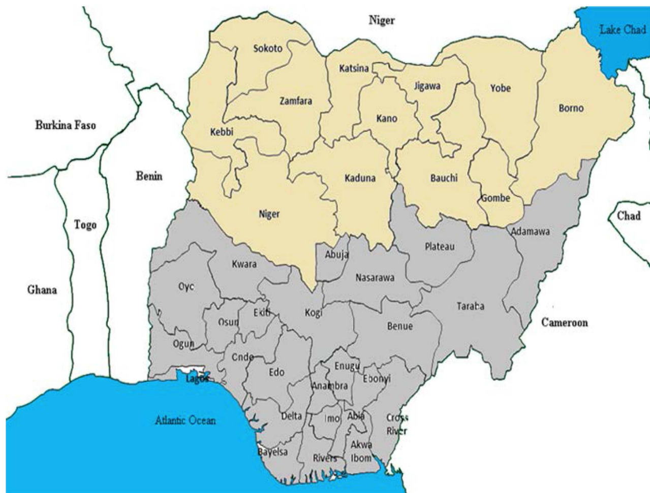
Figure 1. Poliomyelitis-prevalent states of northern Nigeria. A line map of Nigeria showing the states (gold) where incident poliomyelitis cases were detected. doi:10.1371/journal.pmed.1001687.g001

The participants were serially trained in weekly sessions for ten weeks. Materials for