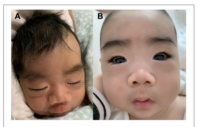
FIGURE 1 | Facial Gestatt of the Patient #1 with de novo KCNT2 variant (A) at birth and (B) at the age of 3 months.

Moreover, it was noticed that the two patients confirmed to carry gain-of-function mutations both exhibited not only severe developmental delay, but also dysmorphic features with hirsute arms, thick hair, prominent eyebrows, and long and thick eyelashes, broad nasal tip, short and smooth philtrum with prominent upper lip, mild tooth displacement with diastema (Ambrosino et al., 2018). Similarly, both of our patients had prominent dysmorphic features with hirsute arms, thick hair,