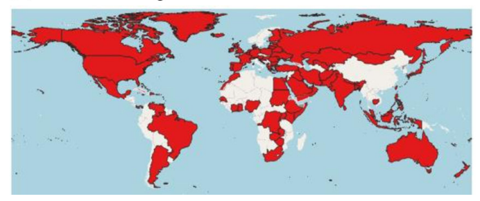
Figure 3 Distribution of countries with statistically significant relative search volume (RSV) of "coronavirus", "wash hand", "social distancing", "hand sanitizer" and "mask" in the last 20 weeks compared with that before the COVID-19 pandemic. Area coloured red: countries with statistical significance in the last 20 weeks versus before the COVID-19 pandemic. Area coloured grey: countries without valid data.

methods are common to many infectious diseases, the increased awareness of people regarding the prevention measures due to the COVID-19 pandemic can be expected to be reflected in future COVID-19 trends