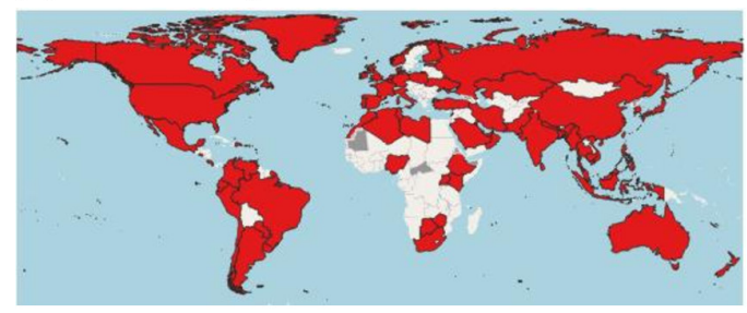
(E) Countries with significant difference of "mask" RSV in the first 20 weeks and the last 20 weeks