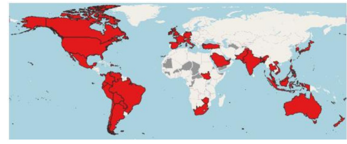
(D)Countries with significant difference of "hand sanitizer" RSV in the first 20 weeks and the last 20 weeks