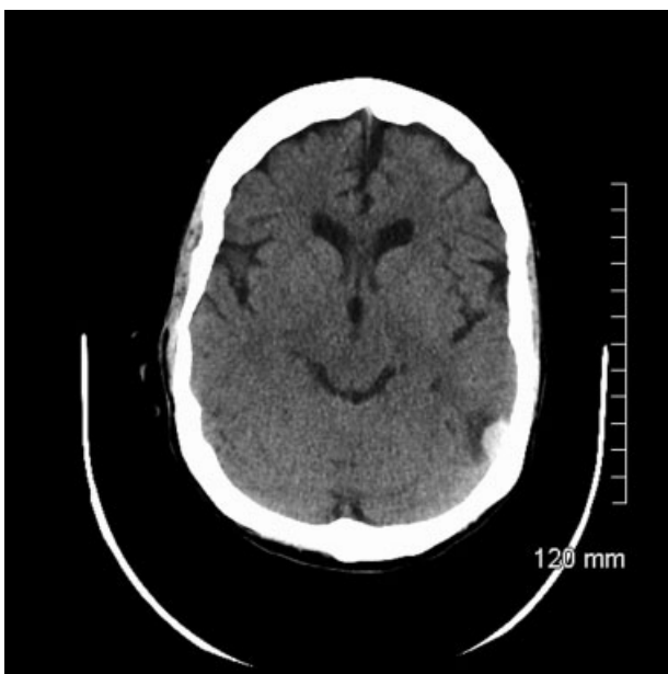
Fig. 1 CT scan of the brain in axial projection following admission showing this very unusual location for any type of hemorrhagic abnormality, requiring better definition as to anatomic location.

After a 4-day hospitalization for evaluation and observation, she was discharged, neurologically improved in terms of visual and speech symptoms as well as headache complaints, to outpatient follow-up. She has remained well with resolution of imaging abnormalities and no reoccurrence of symptoms.