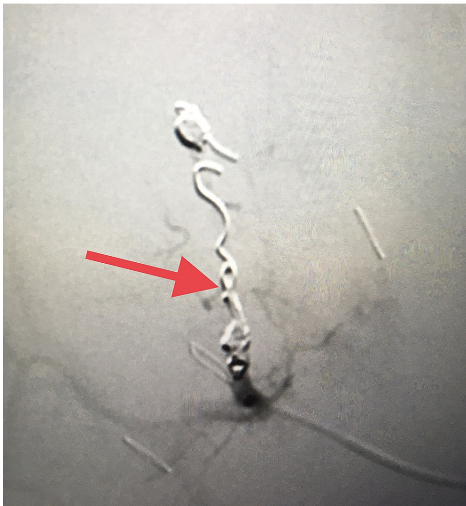
FIGURE 3: Embolization of right hepatic artery pseudoaneurysm (red arrow depicts the coils).

The patient was taken back to the operating room on postoperative day two for a planned re-exploration. The packs were removed, drains were inserted for a noticeable bile leak, and wound closure was done. The patient did well and was eventually discharged from the hospital in a stable condition. Follow-up in our clinic was uneventful.