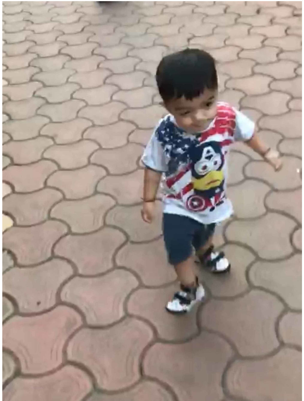
FIGURE 4: Independent walking

weight-bearing exercises and joint compressions. Vestibular input was given by the swing system. Wheelbarrow walking was practised for activating scapular muscles. Rib cage mobilization, facilitation of right side flexors of the trunk, and hanging with upper trunk support were done to manage mild scoliosis. As the child began to perform unsupported standing while wearing bilateral ankle-foot orthosis (AFO), a walker (rollator) was used as an aid for walking under close supervision. He practised standing on a balance board and stability disc with minimal support accompanied by multidirectional reaching while standing and pushing-pulling activities. He practised bouncing on a Swiss ball and trampoline with support and kicking a ball with ankle weight cuffs. Thereafter, walking was practised on a firm surface with a bilateral supramalleolar orthosis (SMO) and walking harness with minimum support. He started walking without support at the age of 36 months (Figure 4).