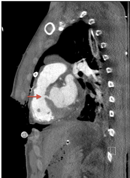
Fig. 2. CT angiogram demonstrates the ventricular septal defect prior to surgical repair.

dark blood in the pericardium. The patient had return of spontaneous circulation. The incision was extended to a clamshell thoracotomy, allowing the identification of an actively haemorrhaging right ventricular injury. This was occluded with direct pressure until a Foley catheter was placed through the ventriculotomy and inflated (Fig. 1), allowing for haemostatic resuscitation and transfer to the operating room. Estimated downtime was approximately 20–25 min.