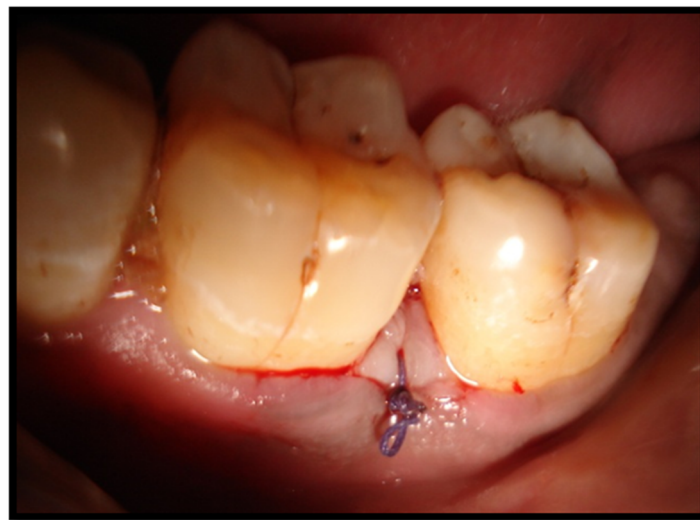
Figure 4. Vertical internal mattress sutures placed for flap approximation.

To prevent any eye injury, both the patient and clinician wore safety goggles during laser irradiation. A vertical external mattress suture was placed at the surgical site similar to that in the control group in order to ensure repositioning. Primary flap closure was obtained by suturing (Figure 4). A coe-pack was placed at the sutured site. A single experienced operator performed all of the surgical procedures.