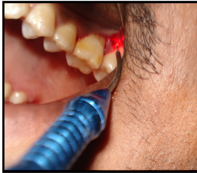
Figure 3. Application of low-level laser therapy on the debrided intrabony defect.

To prevent any eye injury, both the patient and clinician wore safety goggles during laser irradiation. A vertical external mattress suture was placed at the surgical site similar to that in the control group in order to ensure repositioning. Primary flap closure was obtained by suturing (Figure 4). A coe-pack was placed at the sutured site. A single experienced operator performed all of the surgical procedures.