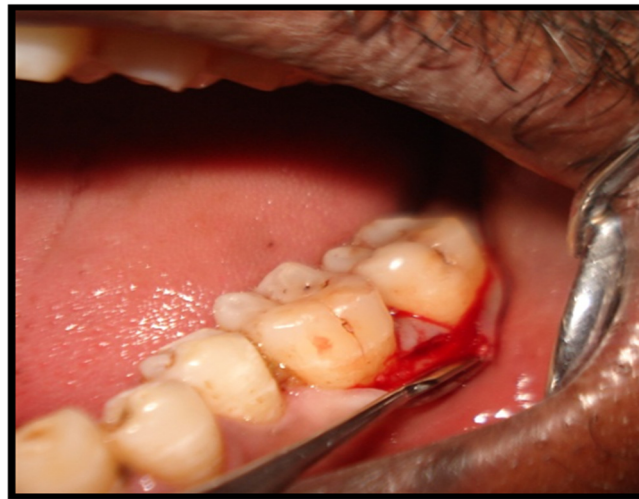
Figure 2. Single flap incision technique (buccal single incision placed).

Local anesthesia was given at the surgical site (2% lignocaine with 1:80,000 adrenaline). As per the principles of SFA (Figure 2), the Buccal mucoperiosteal flap was raised. A buccal envelope flap was made using Sulcular incisions in the surgical area following the gingival margin of the teeth. A horizontal or oblique butt joint incision was made at the level of the interdental papilla, and the interdental papilla was untouched. Minimal mesiodistal extension was maintained, while also ensuring adequate access debridement of the defect. The required amount of pristine supracrestal soft tissue along with the undetached oral papilla was preserved, in order to ensure flap adaptation and clear surgical access to the defect. Root debridement was performed using both mechanical and ultrasonic methods.