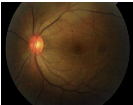
Figure 1. Fundus photography of the right eye showed commotio retinae inferiorly involving the macula was seen in case 1.

Nine days later his vision improved to 20/70, with trace of microscopic hyphema and flat retina the topical prednisolone acetate 1% drops frequency reduced to every three hours and atropine stopped. He developed dense posterior and anterior sub-capsular cataract (Fig. 2B) dropped his vision to the range of 20/200 for which he underwent cataract extraction with posterior chamber intraocular lens with the final BCVA 20/30 and 15 mmHg IOP but with permanent pupil dilation.