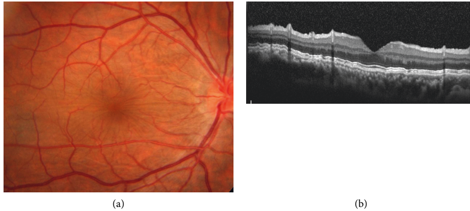
FIGURE 1: Fundus photographs and optical coherence tomographic images in a patient with hypotonic maculopathy after blunt ocular trauma. (a) Choroidal and retinal folds were observed at the posterior pole. The patient's visual acuity was 20/50, with an intraocular pressure of 5 mmHg. (b) An image of vertical optical coherence tomography through the fovea showed significant choroidal and retinal folds.