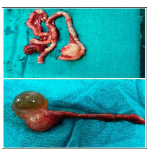
Figure 3: Resected ileal duplication cysts with atretic ileal segments.

their size varied greatly from smallest being 3×3cms to largest being 10×10cms in size. However, one case of giant ileal duplication cyst was encountered where the cyst measured approximately 15×12cms. One case had associated perforation of gut leading to peritonitis. Associated atresia of gut was observed in 4 cases (1 case had type III duodenal atresia, 1 had jejunal atresia with malrotation, and 2 neonates had ileal atresia). The most common site for duplication was found to be ileum present in 12 neonates, thus, accounting for 71% of cases. Two of the neonates had duodenal duplication cyst while three other neonates had gastric, colonic and cecal duplication cyst, respectively. Ileal, cecal, and colonic duplication cysts were excised along with intimately adherent part of normal GIT and end to end anastomosis was performed (Fig. 1-3). However, gastric and duodenal duplications were managed by cyst excision and mucosal stripping. The resected specimen on histopathological examination confirmed the diagnosis of gastrointestinal duplication (Fig. 4).