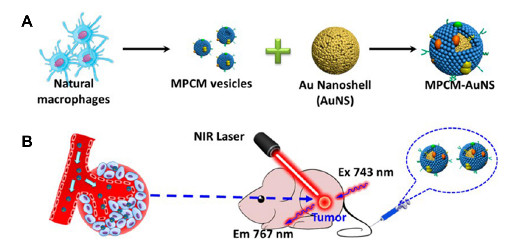
Figure 3 (A) Schematic illustration of the preparation and (B) in vivo photothermal cancer therapy of macrophage cell membrane (MPCM)-camouflaged Au nanoshells (MPCM-AuNS).

Notes: Reprinted with permission from Xuan M, Shao J, Dai L, Li J, He Q. Macrophage cell membrane camouflaged Au nanoshells for in vivo prolonged circulation life and enhanced cancer photothermal therapy. ACS Appl Mater Interfaces. 2016;8(15):9610–9618. Copyright (2016) American Chemical Society.<sup>35</sup>