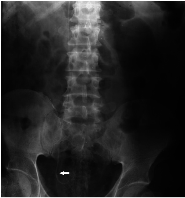
Figure 1. KUB After Placement of DJ Stent in Right Ureter

The X-ray revealed an abnormal pathway of the double-J stent that probably entered into the inferior vena cava. The arrow shows the position of the ureteral stone, 8 × 6 mm in size, at the ureterovesical junction.