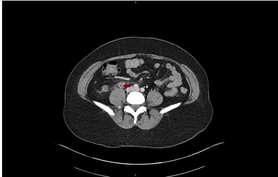
FIGURE 3: Axial section of computed tomography scan with contrast of abdomen and pelvis showing right ovarian vein thrombosis (Arrow)

Other pertinent negative tests included B2 glycoprotein, Factor V Leiden mutation, Protein C and S activity, Prothrombin mutation, Plasminogen Activator Inhibitor-1 (PAI-1), CA-125, Janus Kinase 2 (JAK2) mutation, anticardiolipin antibodies, and dilute russell viper venom time (DRVVT) confirmation test. The patient was initially started with a therapeutic dose of low molecular weight heparin (LMWH) with relief of symptoms the next day and was later transitioned to rivaroxaban upon discharge.