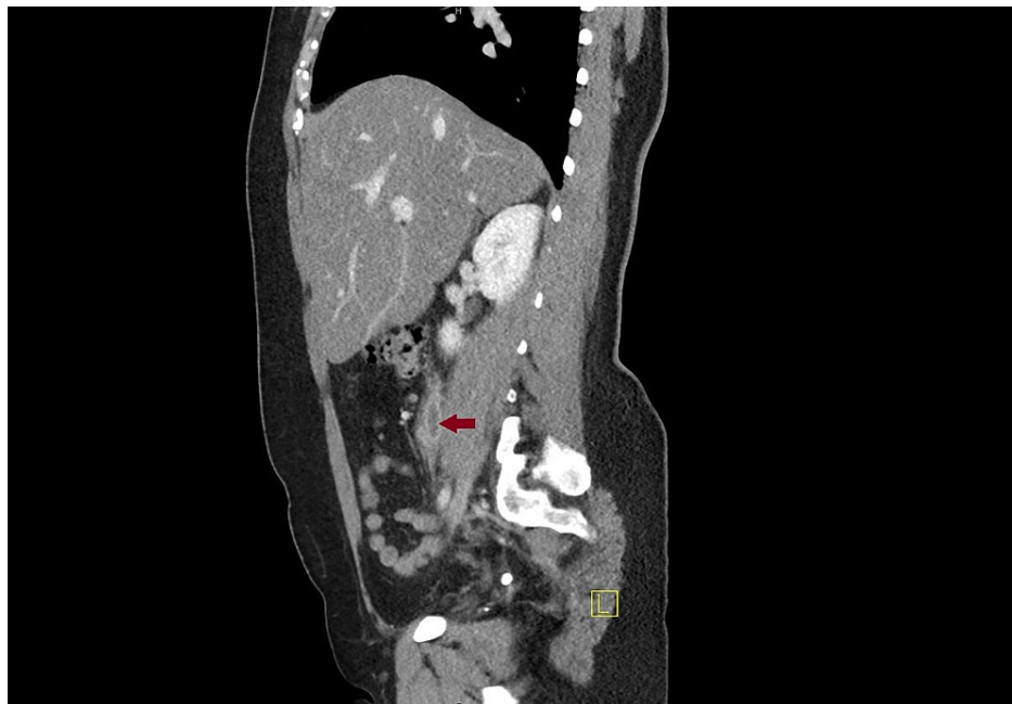
FIGURE 2: Sagittal view of computed tomography scan with contrast of abdomen and pelvis showing right ovarian vein thrombosis (Arrow)