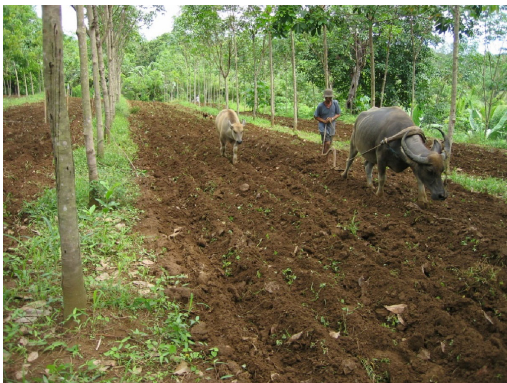
Figure 1 Planting rice and mungbean in an experimental site in Mindanao with three-year-old rubber.

a UPL Ri-5 and Dinorado in fractions of rows.