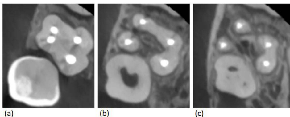
Figure 2 Post-operative Cone Beam Computed Tomography scan (axial sections) for tooth #17. (a) Coronal root view showing 4 obturated canals. (b) Mid root view showing separate mesio-buccal canal in addition to disto-buccal, mesio-palatal, and disto-palatal canals. (c) Apical root view showing two separate mesio-buccal and disto-buccal roots, and one bifid palatal root encasing two palatal canals.

Despite the wide range of variations in the reported root and canal morphology of MSM teeth, the presence of two palatal canals is considered a rare occurrence. MSMs most commonly have one palatal root with a single canal. The existence of two palatal canals/roots in MSM's is rare, but should be considered by dental practitioners, to aid in proper diagnosis and effective treatment of such cases. In the current case, several factors aided in the diagnosis and treatment of a second palatal canal; knowledge, skills and proficiency of the operator, careful inspection of pulp chamber floor under