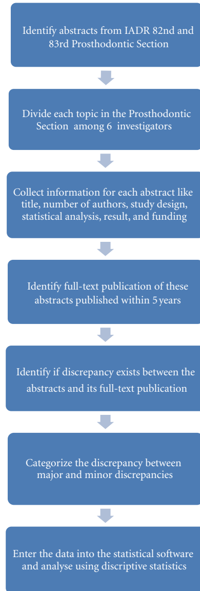
FIGURE 1: Flow chart of materials and methods.

Abstracts from poster and oral presentation for Prosthodontic Research Section of IADR 82nd and 83rd General Sessions (March 2004 and 2005) were obtained and divided among the six investigators (Figure 1). The investigators extracted data independently. For each abstract, the following basic information was collected: abstract topic, type of abstract,