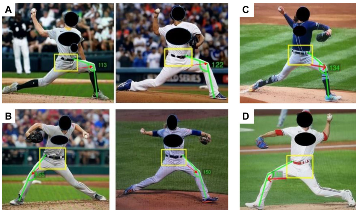
Figure 1. Experimental setup and kinematic parameter measurements. (A) Drop and drive (DD) pitchers captured, 90°-130° of knee flexion. (B) Tall and fall (TF) pitchers captured, 140°-180° of knee flexion. (C) TF pitcher captured, ~130°-140° of knee flexion with pelvis above the drive-leg knee level. (D) DD pitcher captured, ~130°-140° of knee flexion and pelvis in line with the drive-leg knee level.