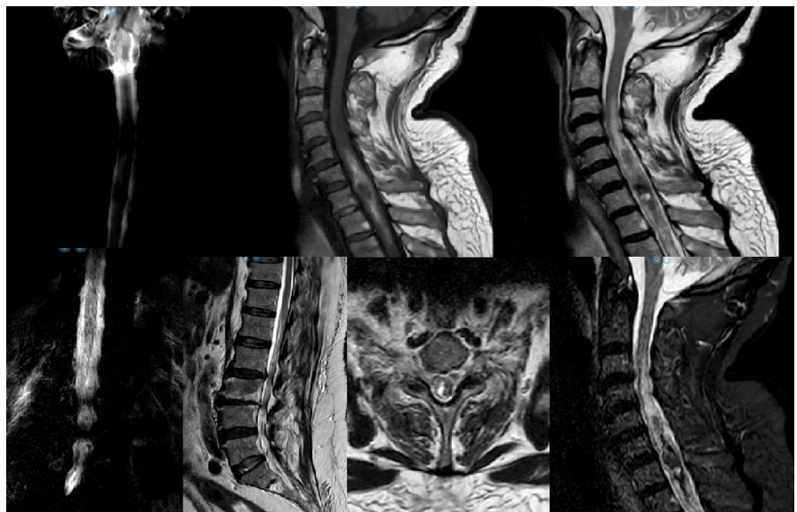
FIGURE 2 Cervical and lumbar spine MRI images of the patient. CSF block is noticeable. Long extensive cervical lesion originating from C3 to T3 with multiple signaling features is highly suggestive for hemorrhagic lesions. Different intensity lesions suggest bleeding at various times. Incidental lumbosacral canal stenosis was detected which was not correlated with clinical picture

In our case, the primary neurological manifestation was polyneuropathy, which was confirmed by EMG-NCS. Within 2 days, it transformed into acute flaccid paralysis with a discriminated sensory level that triggered a high index of suspicion to an acute cord hematoma. It was unclear whether the primary quadriplegia resulted from an insidious small cervical cord hematoma or a clinical manifestation of concurrent neuropathy. This clinical picture