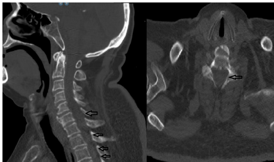
FIGURE 1 Cervical spine MDCT. Round intracanal iso-dense lesions were suspected behind C5–T2 (arrow heads). These lesions are not like intracranial hematoma (which are hyper dense) and this feature makes it more tricky to detect

Cervical CT scan images showed suspicious round and iso-dense lesions in the cervical spinal canal posterior to C5–T2 vertebral bodies (Figure 1). A whole-spine magnetic resonance imaging (MRI) was taken. Cervical spine MRI images revealed CSF blockage in cervical region myelography. There was a mixed intensity core in the context of hypo/hyperintense signal change extending from C3