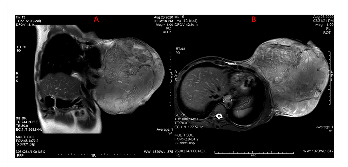
FIGURE 1 | MRI scan showing a giant mass in the left breast with skin ulceration. Without chest wall infiltration or axillary lymph node metastasis were observed. (A) Sagittal MR scanning, (B) Horizontal MR scanning.