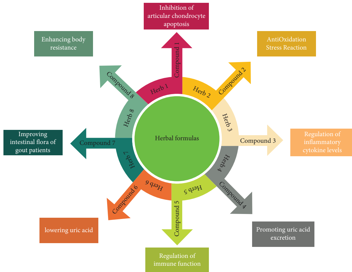
FIGURE 2: Chinese medicine herbal formulas include multiple ingredients for wholistic therapy. Herbal formulas consisted of many active ingredients that form the essential units of herbal function, such as the various mechanisms of anti-GA formulas.

to regulate antioxidants and reduce the oxidative damage to the body. Herba Ephedrae Sinicae (Mahuang) can remove reactive oxygen species (ROS) and has an obvious antioxidant effect [68].