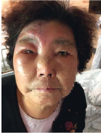
FIGURE 1: State of the right upper eyelid on the day of hospitalization (13 days after the onset of rash).