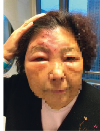
FIGURE 2: State of the right upper eyelid five days after intravenous administration of vitamin C.

quality seriously affected. She has prescribed 75 mg pregabalin along with paracetamol/tramadol (37.5 mg/325 mg) three times per day. There was no pain relief on the second day. Therefore, paracetamol/tramadol was replaced by 100 mg tramadol hydrochloride every 12 hours. Two days later, the VAS dropped to 6, but her duration of sleep at night still lasted for no more than 3 hours. It was unrealistic to perform supraorbital nerve blockade as her eyelid was severely edematous, and thus, the right stellate ganglion block (SGB) was recommended. However, the patient refused to take SGB. After confirming that there was no contraindication of using vitamin C, a mixture of 250 ml normal saline water and 4 g vitamin C was administered intravenously on the fourth day of hospitalization. However, it did not alleviate the pain, and therefore, vitamin C dose was added up to 8 g the next day. The VAS was reduced to 3 at night, and the patient slept for about 6 hours without pain disruption. After 5 days of treatment, the patient claimed that the pain was unperceivable, and there was a significant improvement in her eyelid edema (Figure 2). After discharge from the hospital, pregabalin and tramadol hydrochloride dose were reduced gradually and stopped within one week, after eyelid edema disappearance (Figure 3). At 3-month follow-up, she continued to be pain-free without any complications.