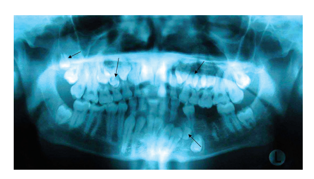
Figure 7. Panoramic radiograph is showing that unerupted teeth and supernumerary teeth (marked with arrows) are in maxilla and mandible (Case 3).

Multiple impacted teeth by itself is a rare condition and often found in association with syndromes such as cleidocranial dysplasia,<sup>2-4</sup> Gardner's syndrome,<sup>2,5-7</sup> Down syndrome,<sup>2,7</sup> Aarskog syndrome,<sup>2,8</sup> Zimmerman-Laband syndrome<sup>2,9,10</sup> and Noonan's syndrome.<sup>2,7</sup> Although some other features were discovered on our cases beside multiple impacted teeth, all features of any syndrome couldn't be diagnosed exactly.