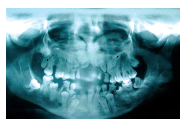
Figure 2. Panoramic radiograph is showing unerupted teeth and supernumerary teeth (marked with arrows) (Case 1).

During the general examination, a height of 165 cm and a weight of 55 kg were registered. The circumference of the head was measured as 49 cm. None of these measurements deviated from the norm. There were epichantus on his eyes and his ear lobes were sticked. Ophthalmological and neurological examination of the patient revealed no pathological symptoms. Intelligence was subjectively normal. Liver and spleen were not palpable. Radiologically, clavicles, vertebral skeleton, chest, skull, hands and feet were normal. CT scan of the paranasal sinus evaluations showed frontal sinus agenesis and maxillary sinus hypoplasia (Figure 3). Results of routine hematology tests and karyotyping (46, XY) were normal. There was no significant medical or dental history of the patient's family.