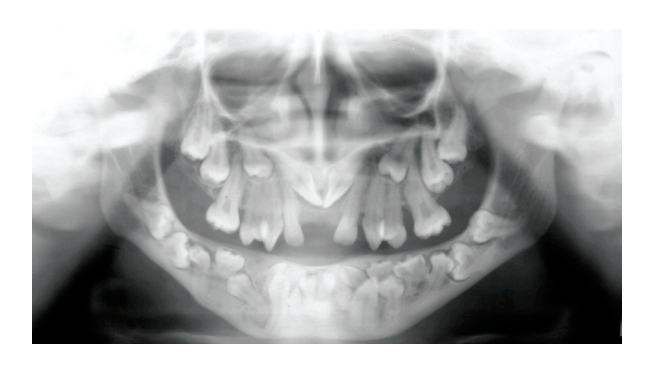
Figure 5. Panoramic radiograph is showing that multiple impacted teeth, ectopic teeth and some dental crown-root abnormalities are in maxilla and mandible (Case 2).

Intraoral examination revealed that the patient's maxilla and mandible were partially edentulous with the following erupted teeth (Figure 6):