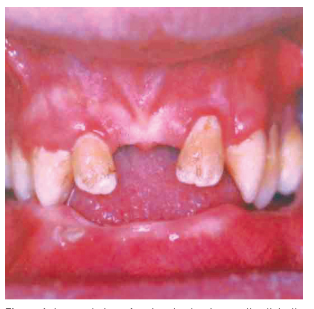
Figure 4. Intraoral view of patient is showing totally clinically edentulous mandible (Case 2).