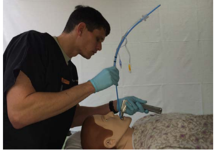
Figure 2. Emergency intubator demonstrating preloaded bougie technique on a mannequin.