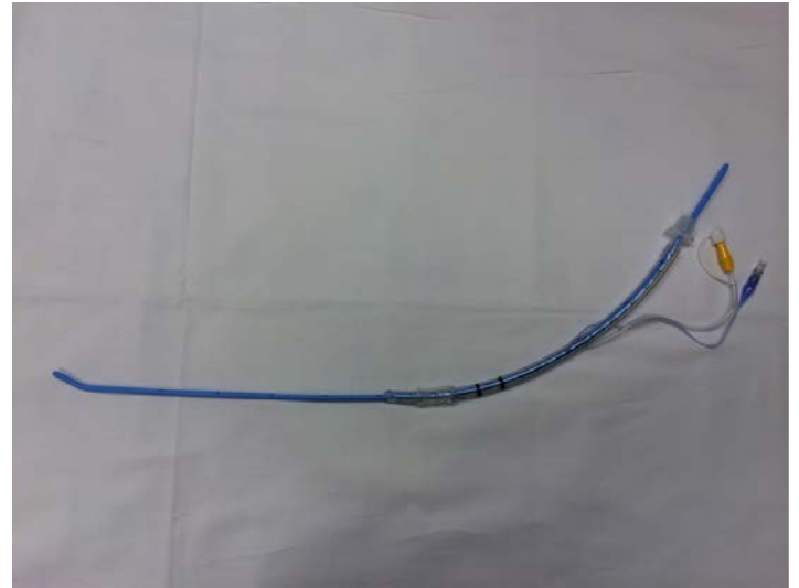
Figure 1. Endotracheal tube preloaded on a bougie.

In this study, we used a human cadaveric airway model to compare success rates and times to successful intubation between the standard method of bougie-assisted intubation and the novel PB technique. Fresh-frozen cadavers have been