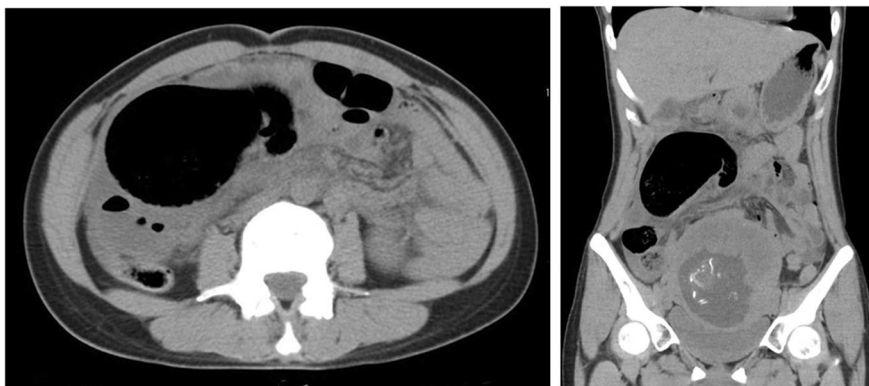
Fig. 1 CT imaging of the abdomen (left, axial view; right, coronal view) In the right mid-abdomen, there was a large air containing cavity connected to the small intestine

Symptomatic MD is often difficult to diagnose because it mimics acute appendicitis, peptic ulcer, pelvic inflammatory disease, or gastroenteritis. In pregnancy, the diagnosis is even more difficult. The normal physiological and