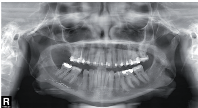
Fig. 5. Panoramic radiograph after three weeks of treatment with pregabalin and prednisone.