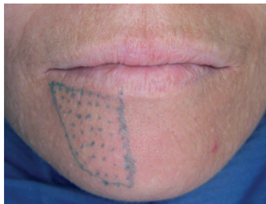
Fig. 4. Three weeks after treatment with pregabalin and prednisone the area of mental nerve anaesthesia has decreased substantially.

The patient noticed a significant improvement in the first days after the medical treatment. One week later, the patient had no pain, and paraesthesia in the region of the right lower lip had decreased more than half of its surface. The prednisone was stopped but the pregabalin regimen was maintained. Three weeks later, the paraesthesia was reduced substantially compared with the initial situation (Fig. 4) and pregabalin treatment was finished. Panoramic radiograph was taken, revealing a significant reduction in the amount of endodontic sealer within the mandibular canal (Fig. 5,6). The patient reported a gradual reduction of paraesthesia and after six weeks signs and symptoms had disappeared.