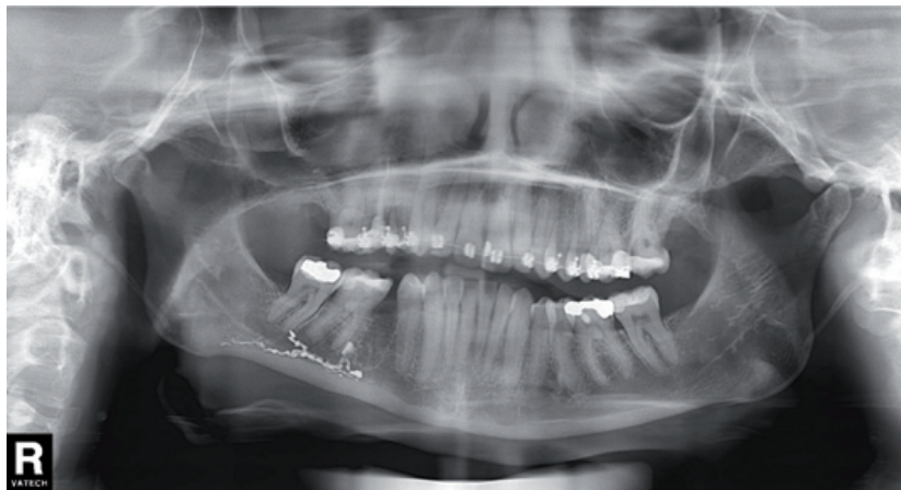
Fig. 2. Panoramic radiograph revealing the presence of radiopaque material (endodontic sealer) within the mandibular canal. Tooth 45 has been extracted.