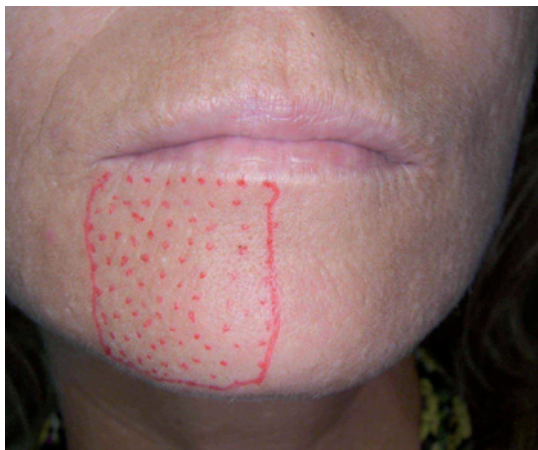
Fig. 3. Three weeks after the accident during the root canal treatment, a delimitation of the mental nerve anaesthesia is performed.

The anaesthetized zone in the region innervated by the right inferior alveolar nerve was delimited by tactile exploration with an explorer (Fig. 3). Neither buccal gingival tissues nor the lower lip between the midline and the second premolar showed sensitivity to thermal or mechanical stimuli.