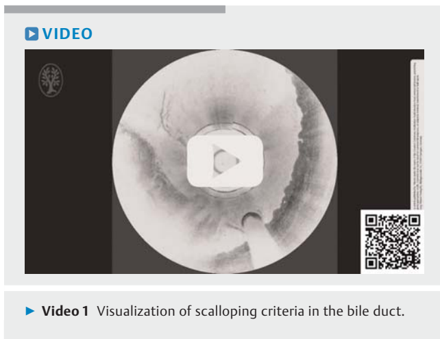
► Video 1 Visualization of scalloping criteria in the bile duct.

After the reference video atlas was created, it was reviewed and confirmed by expert interventional endoscopists with experience in biliary OCT.