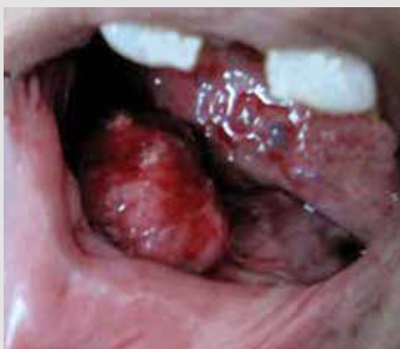
Figure 2. Ulcerated polypoid gingival mass in a patient recently diagnosed with lung adenocarcinoma