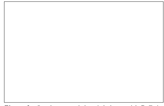
Figure 2. On the second hospital day, atrial fibrillation was detected.

Attempt to elevate her temperature using heating blanket and heating lamp continued from the first hospital day to 11th day when fever reaching 38.3 developed. From the first hospital day, 1,000 mg/day of pulsed methylprednisolone intravenous injection was done for 5 consecutive days and subsequently high dose prednisolone (60 mg/day) therapy was continued. Then, six cycles of monthly cyclophosphamide pulsed infusion were performed while tapering steroid dosage. Thereafter, her general condition was improved.