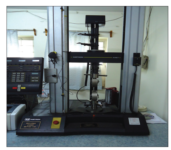
Figure 1: Instron Universal Testing machine

The maximum shear bond strength values were recorded for Group B, where the self-etch adhesive (Adper<sup>TM</sup> Prompt<sup>TM</sup> L Pop<sup>TM</sup>) was used, with the mean value of 2.74 MPa and a standard deviation of 0.10. On the other hand, Group C (without any bonding agent) displayed minimum shear bond strength, with a mean of 1.42 MPa and standard deviatation of 0.64, and Group B, with the total-etch adhesive (Adper<sup>TM</sup> Scotch Bond 2 Adhesive) showed a mean shear bond strength of 1.89 MPa with a standard deviation of 0.03 [Figure 2].