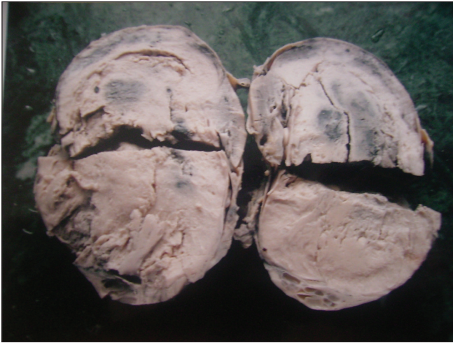
Figure 1: Clear cell sarcoma of the kidney. The gray-tan tumor is large, soft focally cystic and necrotic