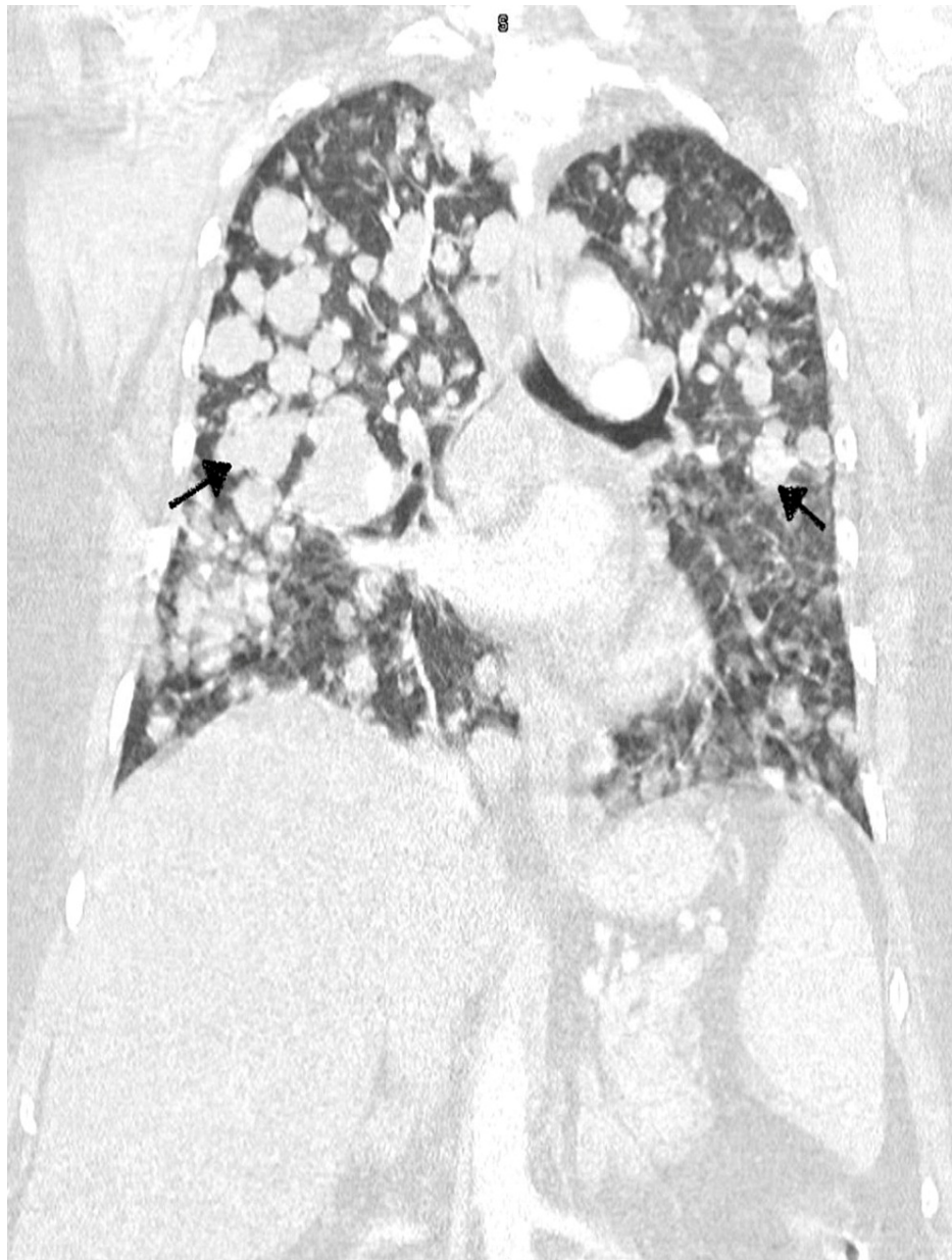
FIGURE 2: CT chest showing multiple lesions in the lung suggestive of metastasis (black arrows)

Coronavirus disease 2019 (COVID-19) test was done, which was negative. Infectious workup, including blood culture, sputum culture and gram stain, legionella, and pneumococcal antigen tests were obtained, and the patient was started on empiric broad-spectrum antibiotics. As there was concern about cervical cancer with metastasis to the lungs, she was seen by a gynecologist and was planned for a biopsy of the cervical mass. Hematology/oncology was on board as well and recommended a biopsy of the cervical mass with cytology, and HPV testing. If the biopsy comes positive for cervical cancer, she was planned to be started on a cisplatin-based chemotherapeutic regimen with the addition of checkpoint inhibitor therapy if the programmed death-ligand 1 (PD-L 1) biomarker was positive.