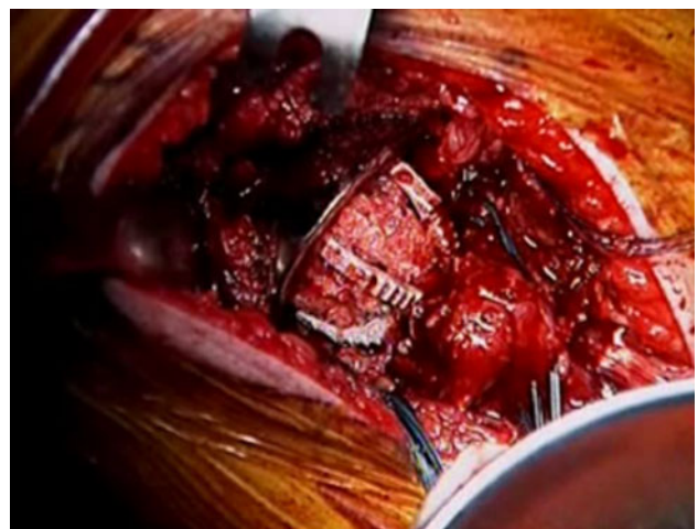
Fig. 1 TESS corolla filled with spongy bone from the humeral head added with autologous growth factors

Patients' satisfaction was graded as very satisfied, satisfied and dissatisfied. The X-ray examination included true AP, and, where possible, axial views. At each follow-up visit, all previous radiograms were examined for periprosthetic changes. The acromio-humeral distance (AHD), i.e. the distance between the acromion and the top of the prosthetic head, was always determined, since an AHD less