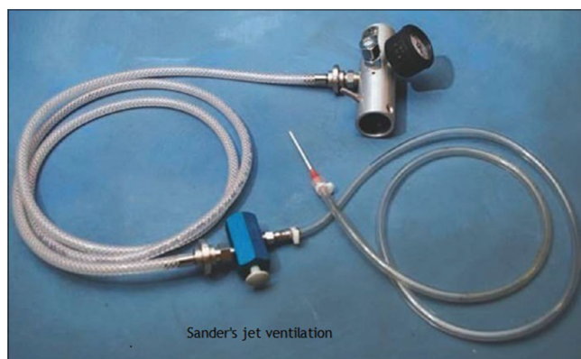
Figure 2: Sanders jet ventilator

Ideal anaesthesia requires hypnosis, analgesia and muscle relaxation. Balanced anaesthesia is usually the technique opted for rigid bronchoscopy. Anaesthesia