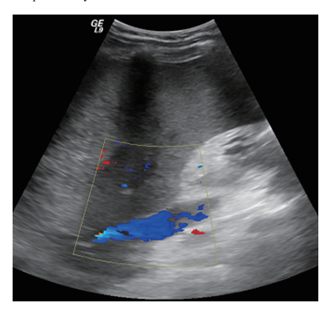
Figure 3. Ultrasound vascular Doppler image shows no hepatic vein outflow and sluggish but hepatopedal portal flow.

BCS is a rare disease characterized by HVOO independent of the level or mechanism of obstruction [1, 2]. This excludes venous obstruction due to sinusoidal obstruction syndrome, pericardial disease, and right-sided heart disease. Venous pooling and increased pressure in the hepatic sinusoids, and the portal system cause hypoxic damage to the hepatocytes. If this occurs acutely, serum transaminases may rise to five times the upper limit of normal, with elevated total bilirubin and a concomitant decrease in albumin [15]. Our patient presented with profoundly elevated serum transaminases. Ascitic fluid