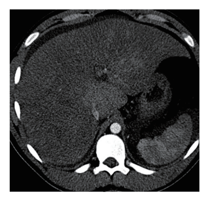
Figure 5. Axial CT abdomen image shows caudate hypertrophy with hyperenhancement. CT: computed tomography.

analysis in patients with BCS reveals serum-ascitic albumin gradient (SAAG) > 1.1 with total protein greater than 2.5 g/dL [15]. Our patient had small ascites revealed in imaging, so no paracentesis was done.