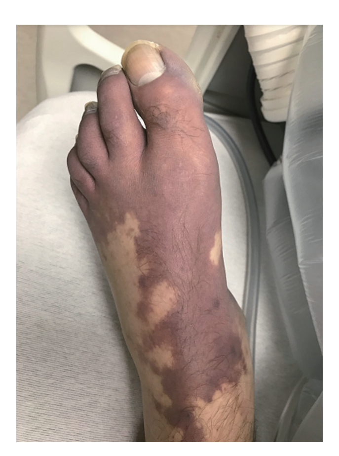
Figure 1. Image of skin changes associated with blue toe syndrome in this patient.

displayed in Table 1. The patient was admitted to the intensive care unit (ICU) for further management. He received two units of platelets, two units of fresh frozen plasma (FFP), eight units of cryoprecipitate, and two units of packed red blood cells (PRBCs). He continued to have persistent hypotension requiring norepinephrine infusion, and continuous renal replacement therapy was initiated due to persistent metabolic acidosis. The patient was treated empirically with broad-spectrum antibiotics. The blue-purple discoloration of his lower extremities was consistent with blue toe syndrome (BTS) that was attributed to arterial microthrombi from disseminated intravascular coagulation (DIC).