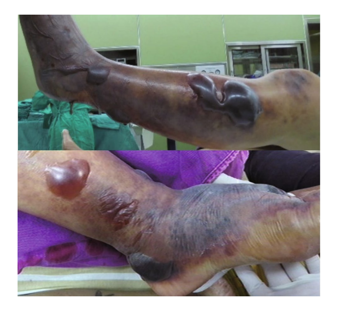
Fig. 2 A 46-year-old male with a history of decompensated liver cirrhosis—Child C, alcoholism, hepatitis B, hepatoma, and end-stage renal disease receiving regular hemodialysis had left lower limb pain and conscious disturbance for one day. The left lower leg developed odor smell, hemorrhagic bullae, diffuse purpura, and necrotic skin lesions with diffuse oozing on the bed in the operation room. After fasciotomy and debridement, the culture of blood, tissue, pus, and wound specimens confirmed Aeromonas hydrophila ; however, this patient died on the 10th day after admission owing to progressive septic shock, esophageal variceal bleeding, and multiple organ failure

[11, 13, 25, 26]. In the present study, more patients presented with shock in the hemorrhagic bullae group, and this result may be due to more Gram-negative monomicrobial bacterium and Vibrio spp. infections that induce septicemia-related systemic inflammatory response symptoms [24, 43]. Skin necrosis is considered as the thirdstage clinical presentation [9] and also as an important clinical feature of NF [8]. Skin necrosis can be found in 13.5% of all patients with NF and 27.9% of Aeromonas spp. NF cases [25]. Hemorrhagic bullae and necrotic cutaneous lesions were considered as the criteria for surgical intervention for NF [13], and they are also independent predictors of mortality of Aeromonas spp. NF cases [25]. NF caused by Aeromonas has been reported to have a high mortality rate (29.4%) in our 18-year retrospective study [25]. Although we found that Vibrio NF cases were more prone to develop hemorrhagic bullae and skin necrosis, we cannot ignore Aeromonas infection as these fulminant pathogens have the same clinical presentation and laboratory findings. About 14.6% of patients in the hemorrhagic bullae group presented with painless skin lesions (Table 3). Therefore, we must very careful to take the history about painless skin lesions besides bullae formation and cutaneous necrotic lesions at ED.