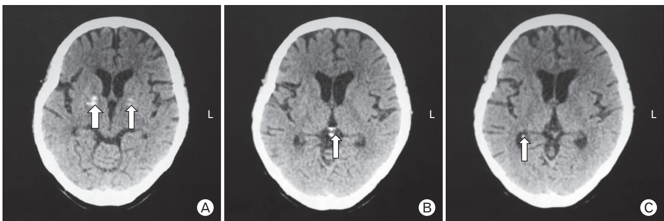
Figure 1. A computed tomography scan of the brain shows presence of physiological calcification in both basal ganglia (A, arrows), pineal gland (B, arrow), and the right choroid plexus (C, arrow).

The case was discussed with a neurologist and based on the presented symptoms and underlying uncontrolled diabetes, diagnosis of hemiballismus secondary due to poorly controlled diabetes was suspected. She was then admitted for blood pressure and blood glucose stabilization, as well as to monitor her symptoms. Investigations in the